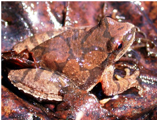
Spring peeper

Other Bog frogs such as the eastern gray treefrog ( Hyla versicolor ), spring peeper ( Pseudacris crucifer ) and boreal chorus frog ( Pseudacris maculata ) have similar strategies of short lives but high reproductive output and good dispersal abilities. They also exploit the fickle temporary ponds. These species are common residents in and around the Bog, with treefrogs and spring peepers utilizing more forested habitats and chorus frogs more open and grassy habitats. All are often heard but rarely seen. Peepers and chorus frogs call in early spring, with familiar peeps and trills. With patience and a headlamp, stalking these frogs at night can be rewarding. They usually call from right at the water surface at the base of plant stems. Treefrogs give their bird-like warbling call later (about the time leaf-out begins), and often from shoreline bushes and trees up to 10 feet high. All three species are most active on rainy or humid nights, when they can be found crossing roads. Treefrogs sometimes hunt insects around outdoor lights and lighted windows at night.