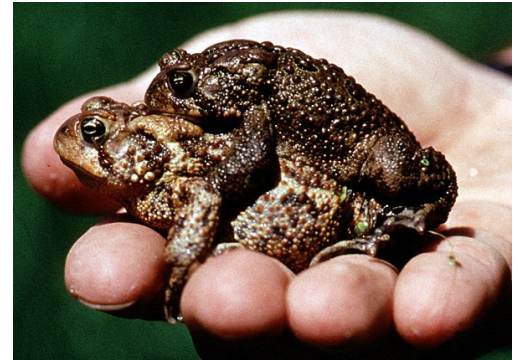
American toads

The eastern American toad is another common Bog dweller, with very generalist taste in habitats, found in many residential settings such as gardens, but also in woodlots, forests and meadows. Very terrestrial, toads visit water only when they breed in May. Their long trills can be heard varying in pitch by the size of the toad and the pitch of its neighbors, resulting in interesting harmonies in the chorus. Like the wood frog group, toads hibernate on land, but rather than being freeze tolerant, they are good burrowers, digging underground to escape the freezing cold. Their soft bellies absorb water to help wait out dry periods. Like bullfrogs, they are highly prolific, laying up to 20,000 eggs. While they do use temporary ponds, they also breed in permanent waters, laying strings of eggs wrapped around shoreline vegetation. Toad eggs hatch quickly, in less than two weeks, and the tadpoles are distasteful to predators. As adults, toads sport large poison glands just behind their eyes, which serve as protection. Many gardeners welcome them for their insect control capacity.