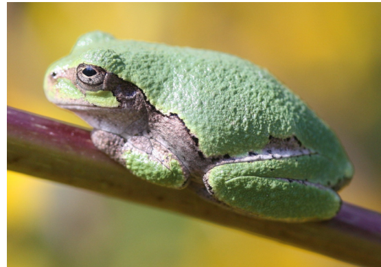
Gray Treefrog

Somewhat more long-lived frogs are the very aquatic American bullfrog ( Lithobates catesbeianus ) and northern green frog ( Lithobates clamitans melanota ). These frogs spend most of their time along shorelines of permanent lakes and streams, and are the last frogs to call, usually in June. The deep bass note of the American bullfrog carries far, while the short twang of the green frog can be heard for many weeks over an extended breeding period. Both these frogs hibernate on the bottom of lakes and streams, and neither is freeze tolerant. Both are highly prolific, laying thousands of eggs each year. The Bog lakes support these frogs, and they are occasionally found in deeper isolated wetlands as well. Bullfrogs are famous for their cannibalism and undiscerning taste, basically stuffing anything that moves into their gaping mouths, with scorpions, bats, small alligators and muskrats all recovered from stomachs.