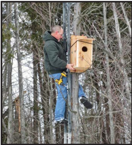
Installing wood duck nest box

A number of measures helped Wood Ducks recover. Restricting hunting seasons and bag limits, habitat improvement, and the passage of protective federal legislation in 1916 and 1918, got the ball rolling, and in the 1930s, the wood duck nest box was developed. Because of nest box programs sponsored by a variety of organizations, these man-made nests are making a lot more sites available in and around wetlands (with a little chewing around the entrance hole, nest boxes become winter homes for squirrels and even raccoons).