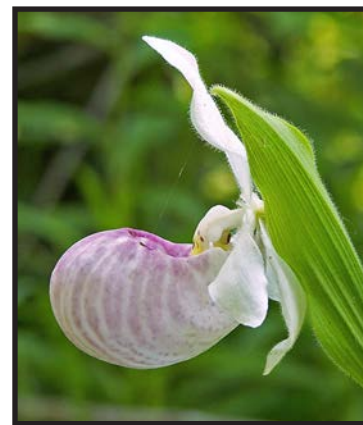
Showy lady's slipper

When Wild columbine blooms along the road edges, Small yellow lady's slippers are flowering in the Bog, fol-